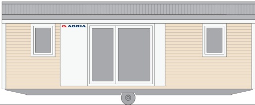
SLine 854 B32