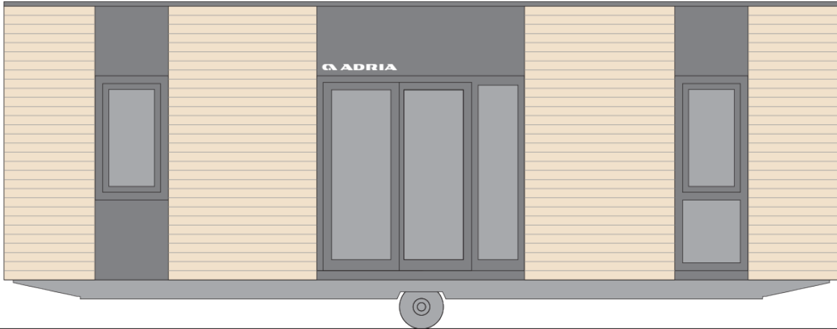
MLine 904 B32